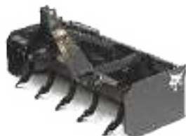
3 pt. box blade