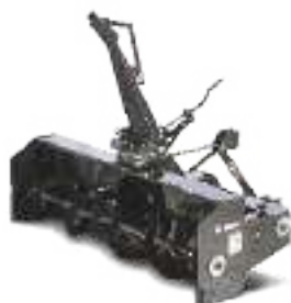
3 pt. snowblower