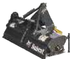
3 pt. tiller