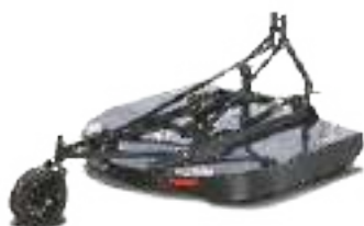
3 pt. rotary cutter