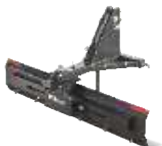
3 pt. angle blade