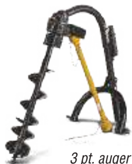
3 pt. auger