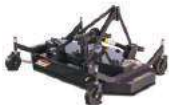
3 pt. finish mower