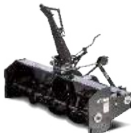
3 pt. snowblower