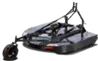
3 pt. rotary cutter