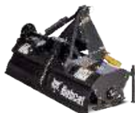
3 pt. tiller