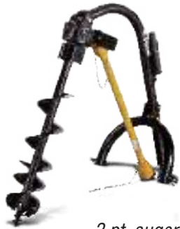
3 pt. auger

You can customize and accessorize your Bobcat compact tractor to improve productivity, enhance durability, maximize operator comfort and more. Simply choose options and accessories* that match your unique demands.