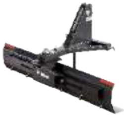
3 pt. angle blade