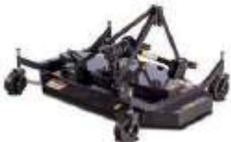
3 pt. finish mower