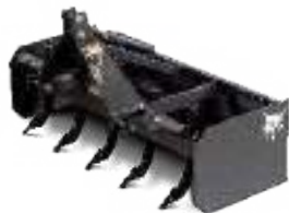
3 pt. box blade